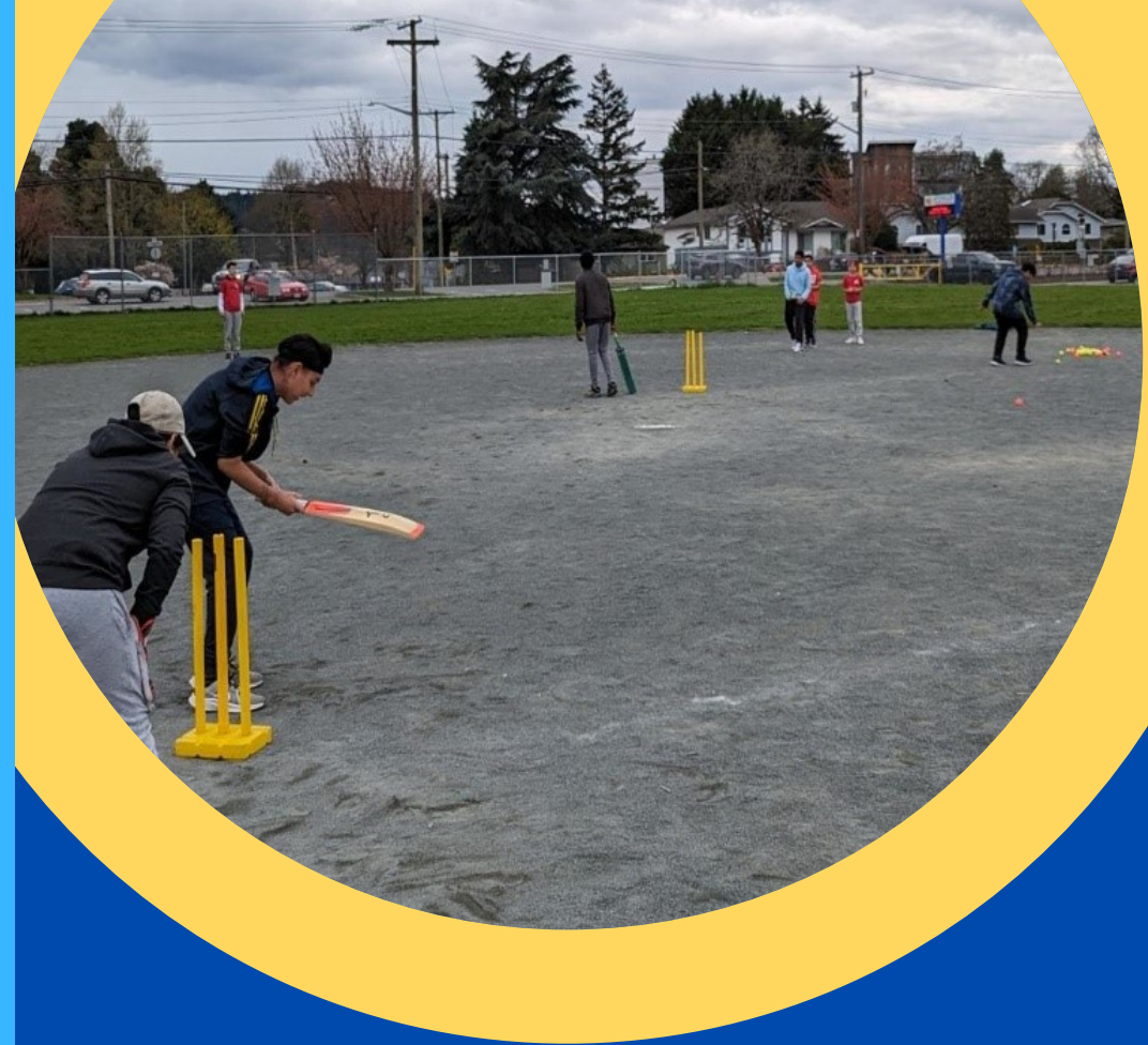
What's the point of training if we don't have games! Spencer Cricket club vs. Westshore Roarers Cricket Club