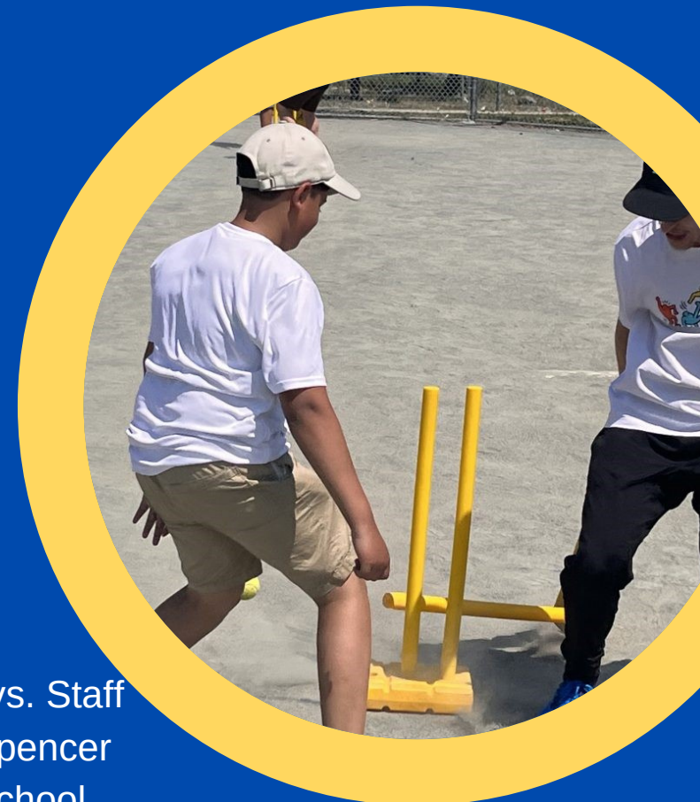
A Student vs. Staff game at Spencer Middle School

There are roughly 30-40 adult cricket clubs, including: Westshore Roarers Cricket Club [ Youth Cricket in Victoria BC | South Island Youth Cricket League (siycl.ca) ] and Island Cricket Club [ Sports Club - Island Cricket ].